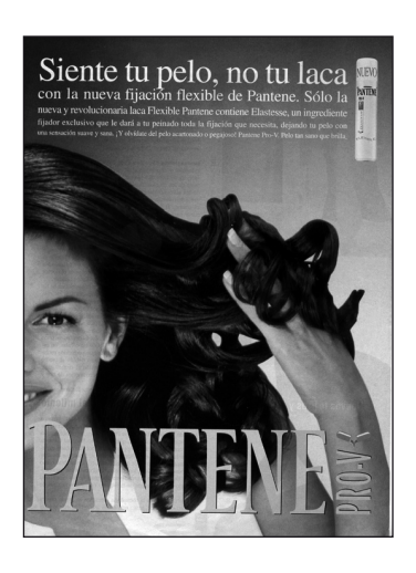
El Semanal, Spain, November 1997

Feel your hair, not your hairspray: new Pantene Flexible. Only Pantene's revolutionary new Flexible Hairspray has Elastesse: a unique holding ingredient that will give your hairstyle all the hold it needs, but leave your hair feeling soft and healthy, not stiff and sticky. Pantene Pro-V. For hair that looks so healthy it shines.