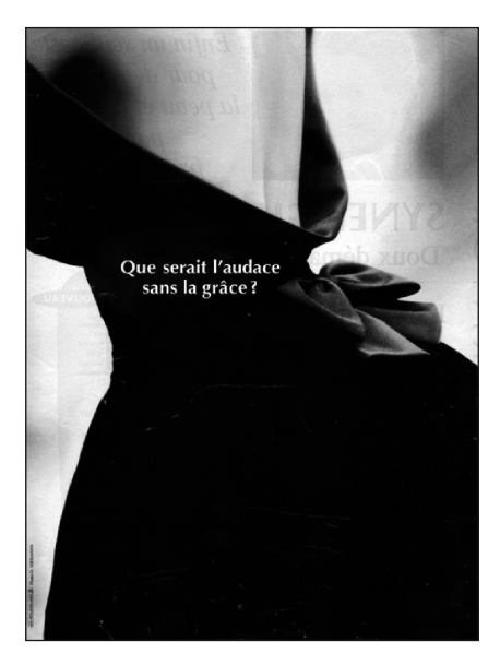
So Pretty, Marie Claire, France, May 1996

In the English version of the advertisement the slogan has been translated as "What is audacity without grace?" (Elle, United Kingdom, June 1996) and in the Spanish one as "¿Qué sería de la audacia si no tuviera encanto?" (Elle, June 1996). In both cases, in an attempt at maintaining the rhyming and assonant effects, the translator may lose the double meaning which underlies the main content. The creative skills of the translators subordinate the effect and formal features of the source text to the content, retaining the ambiguity from the verbal and non-verbal component but suppressing the rhyme and assonance of the verbal one. Likewise, the decision about the lexical choice tests the translator's semantic and pragmatic competence, as s/he has to consider and weigh the pros and cons of selecting a word as the translation of terms like "audace" or "grâce" which add value and connotative meaning to the product. In Spanish the term "grâce" may have been rendered as "gracia", thus preserving the rhyme of the source text. However, this choice would not have been adequate, since "tener gracia" ("to possess grace") in Spanish is synonymous with "being pretty" but has other connotations such as "having wit or spark", which seem to be a bit odd with regard to the woman being portrayed in the picture.