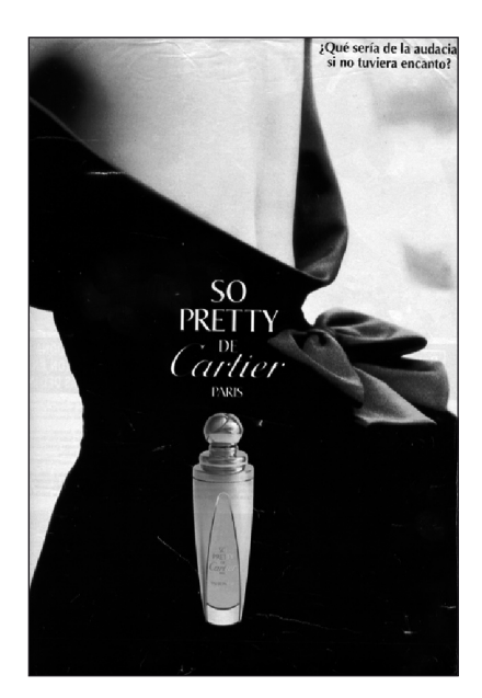
So Pretty, Elle, UK, June 1996