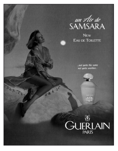
Un Air de Samsara (Elle, 1996)

Samsara means the eternal cycle of life. It is an imaginary place, sacred and mysterious, where Orient and Occident meet. Samsara is the symbol of harmony, of absolute osmosis between a woman and her perfume. It is a spiritual voyage leading to serenity and inner contemplation<sup>4</sup>.