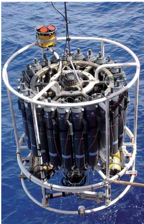
The rosette-CTD-LADCP is a sampling unit comprising several sensors (to measure salinity, temperature, pressure, fluorescence, dissolved oxygen and flow speed) and twenty-four 12-litre bottles (to take water samples at different depths that may be used for the analysis of many other parameters). The results allow examining how these properties change with depth and what characterizes the different water bodies.

zonal tropical current system, to eventually reach the North Brazil Current (Castellanos, 2012).