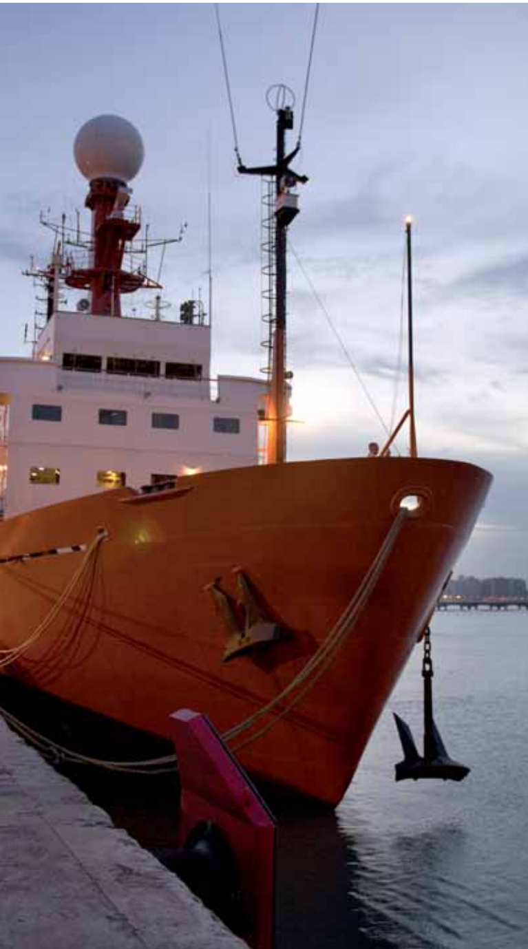
The MOC2-Equatorial expedition was carried out aboard the Oceanographic Research Vessel Hespérides from Fortaleza (Brazil) to Mindelo (Cape Verde). In total, there were 42 days of navigation during April and May 2010 in the tropical and equatorial Atlantic Ocean involving researchers from various national and international institutions.

the subpolar regions (Gulf Stream and North Atlantic current). The waters of the North Brazil Current transport large amounts of heat to the northernmost regions of the Atlantic and allow, among other things, for northern Europe to have a mild climate. Part of this heat flow comes from the Indian Ocean, an ocean closed to the north, which causes the whole radiative heat stored in this tropical region to go south. This heat may partially escape into the Atlantic through the Agulhas Current, but a large part is just the result of the warming of Antarctic waters during their transit through the South and Equatorial Atlantic.