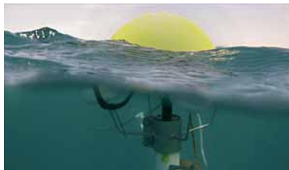
Some stations have launched instrumented drifting buoys that will transmit data on the ocean for years to come.

«THE OCEAN ABSORBS ABOUT HALF OF THE GLOBE'S ANTHROPOGENIC CARBON, THUS WEAKENING THE GREENHOUSE EFFECT»