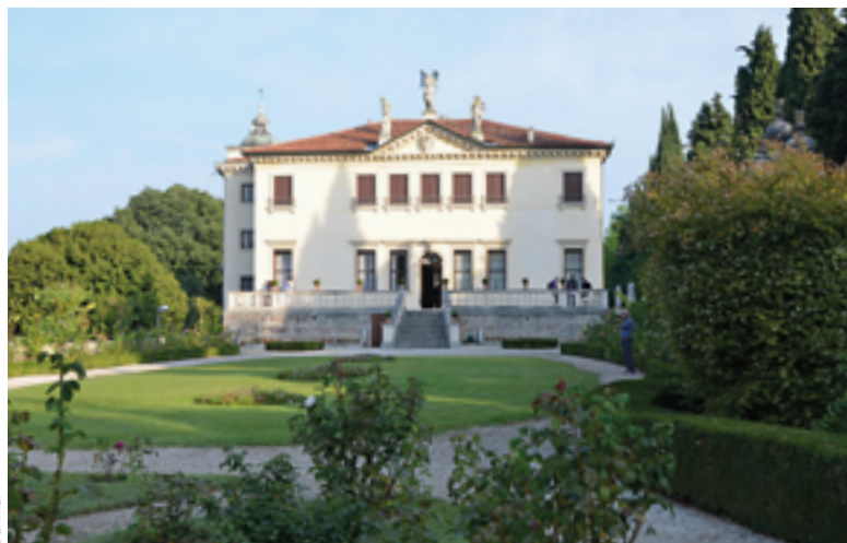
Figure 2. In most cases, the locations chosen for the consultation were also meant to convey a sense of neutrality in terms of scientific authority. In the picture, Villa Valmarana ai Nani, Vicenza, the location of the Italian CONCISE consultation.

The core methodological procedure of the research are public consultations with citizens of the five participating countries. It is through these consultations that citizens are engaged in the scientific process, contributing to the production of science by sharing their opinions, perceptions, and suggestions to improve science communication.