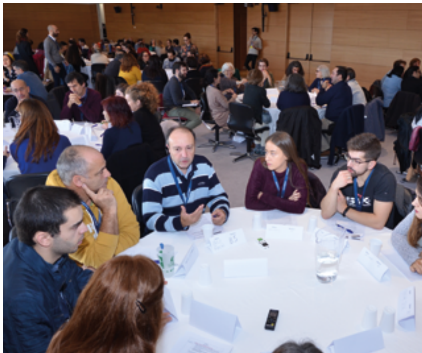
Figure 4. Discussion tables in the CONCISE consultation in Lisbon. The tables were heterogeneous in terms of gender and age, to create a more lively and diversified discussion.

The CONCISE team has already produced two kinds of dissemination materials about the process of