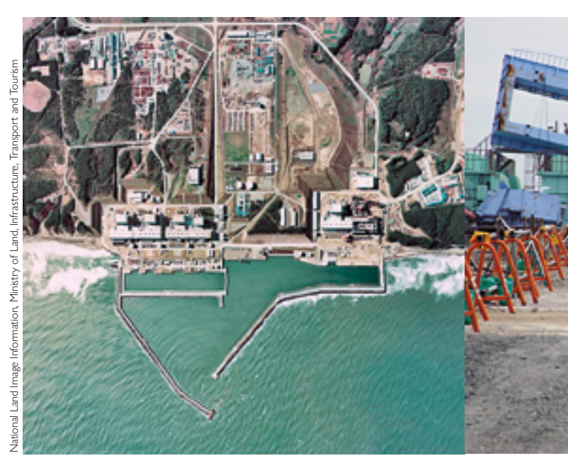
After the earthquake and tsunami, the Fukushima Daiichi nuclear power plant melted down, releasing a tremendous amount of radioactive materials into the atmosphere. On the left, photograph of the Fukushima reactors before the accident. On the right, members of the International Atomic Energy Agency (IAEA) fact-finding team in Japan visit the power plant on May 2011.