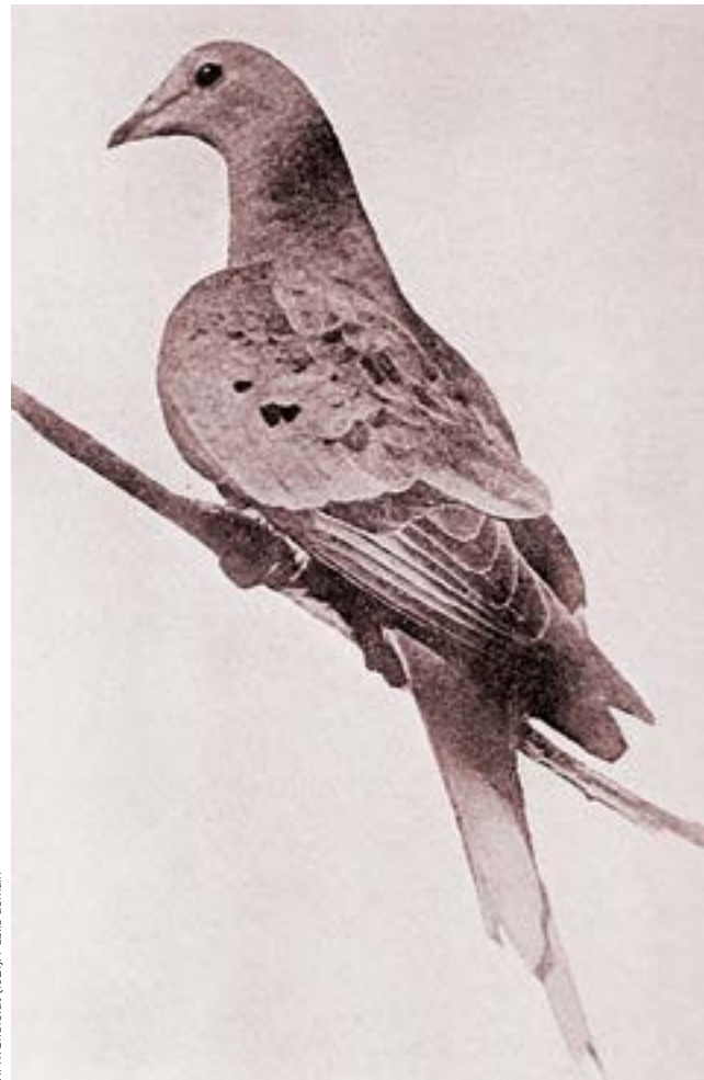
R. W. Shufeldt (1921). Public domain

Growing evidence now indicates that the destruction of natural habitats not only reduces species diversity, but also reduces the diversity of evolutionarily