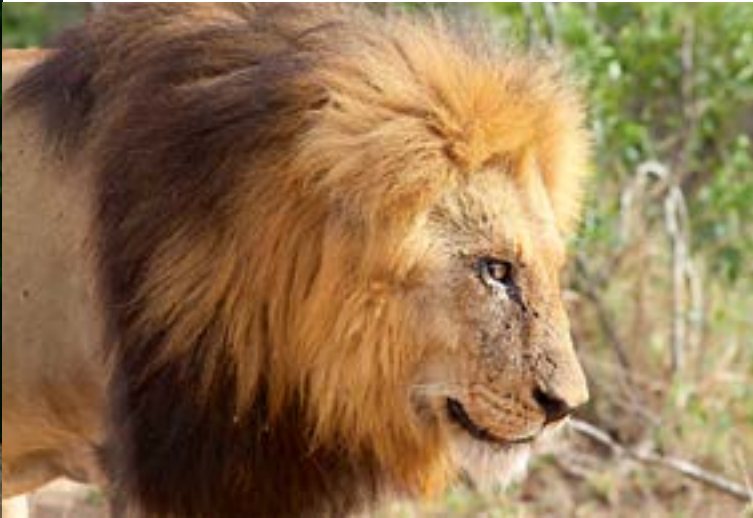
Figure 5. The African lion is a species classified as vulnerable on the Red List of endangered species published by International Union for the Conservation of Nature. However, it is still hunted for sport in many places in Africa.

has a huge impact on the economy. On the one hand, it offers key services that would otherwise involve expenses impossible to assume by governments. On the other hand, it can be a source of wealth generation and a way to reduce poverty, for instance through the payment of environmental services, sustainable exploitation of natural resources, and nature-based tourism. In Costa Rica, (one of the most biodiverse countries of the planet), between 1940 and 1970 approximately one quarter of the country's forests were cut down and converted into crops and pastures. The situation changed radically from the 1970s, when biodiversity began to be perceived as a good in itself. Currently, 25 % of Costa Rica's surface area is protected and its management is shared between the government and landowners. Benefits derived from ecotourism and the government's payment for environmental services such as carbon dioxide fixation or biodiversity maintenance, make it more profitable for landowners to preserve the forest rather than cutting it down.