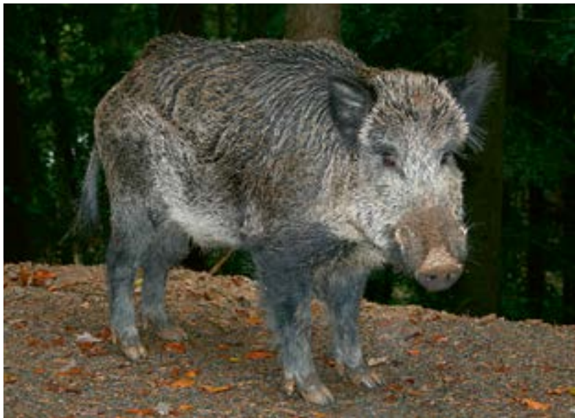
Figure 4. Behavioural plasticity is particularly relevant in animals to face environmental changes. For example, those living close to humans, like the wild boar in the picture, are starting to become more nocturnal. Nocturnal activity is advantageous because it reduces conflicts with people, one of the main risks of living in close proximity to humans.

The last reason that protected areas cannot sufficiently preserve biodiversity is that more than half the human population currently lives in urban areas and benefits directly from the biodiversity offered by these areas. Therefore, there is a growing need to promote local biodiversity in environments