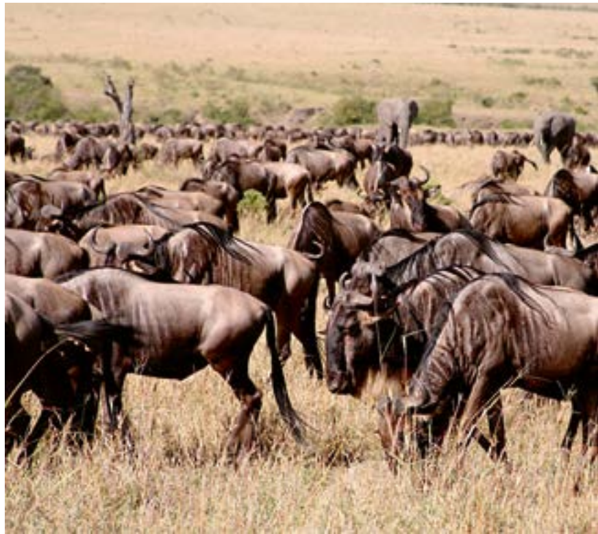
Figure 3. Each year, more than 1.4 million wildebeest travel approximately 1,000 kilometres between Tanzania and Kenya in «the great migration». This trip lasts months and is full of dangers from many predatory species. Although there is controversy about why wildebeest undertake such a long trip, there is no doubt about its impact on the savannah. Their passage keeps the vegetation low and reduces the risk of fire and is essential for the functioning of the ecosystem. The image shows a herd of wildebeest in the Masai Mara reserve in Kenya.

An alternative mechanism to evolutionary rescue is phenotypic plasticity, the ability of organisms to express different phenotypes in different contexts. Behavioural plasticity is particularly relevant in animals. Through learning, for instance, animals can develop new behaviours and improve those already established in order to help them deal with a wide range of challenges such as deciding upon the best place to live, accessing new types of foods, or facing new enemies (Figure 4). In vertebrates, this learning ability is associated with a higher probability of surviving rapid environmental changes (Sol, Duncan, Blackburn, Cassey, & Lefebvre, 2005; Sol et al., 2012).