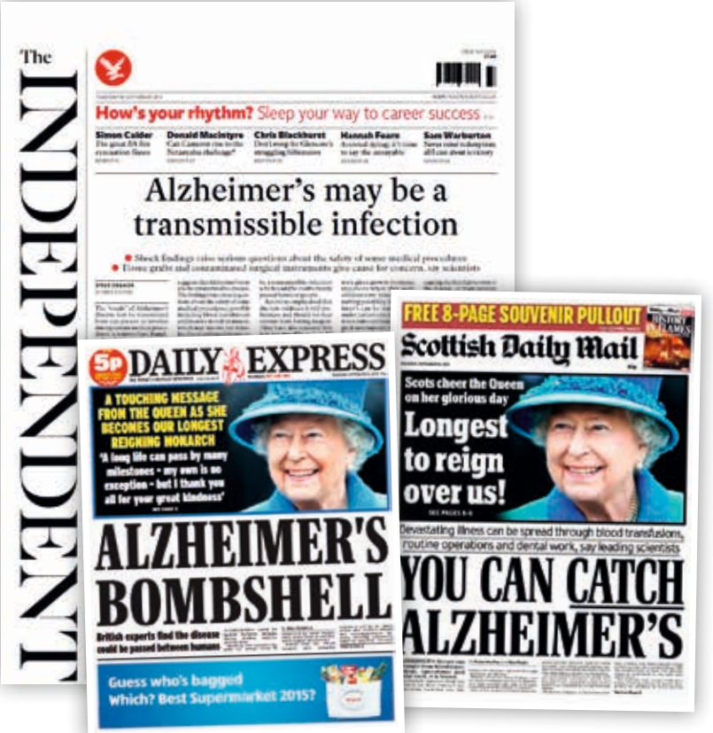
In 2015, University College London published a press release about the possible transmission of the amyloid beta pathology which included the word Alzheimer in the headline, even though the original research article did not refer to this neurodegenerative disease. This caused great confusion in the media, and the next day, many British newspapers published alarmist headlines falsely concluding that Alzheimer's disease was contagious.

Finally, the media frequently make serious science-reporting mistakes. The most common problems include not properly contrasting and contextualising before publishing, exaggerating results, and sensationalism. In the most serious cases, a journalistic failure to properly confirm or contrast information has helped to spread false or exaggerated stories. This recently occurred in Spain with the infamous Nadia case: for eight years, and with the help of coverage from several general media outlets, Nadia's parents raised more than a million euros for a non-existent treatment for her disease, trichothiodystrophy. However, the deceit was unveiled in 2016 by other specialised media such as Mala Prensa , Hipertextual , and Materia , who called the