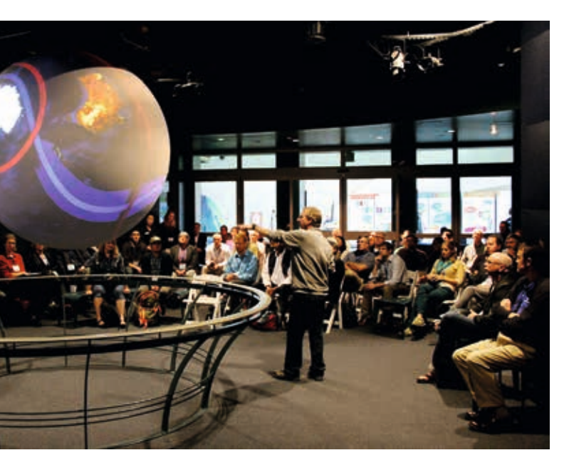
The influence that scientific and technical research has on society is always growing. However, advances and progress have not been accompanied by a gradual increase in the scientific culture of the population.