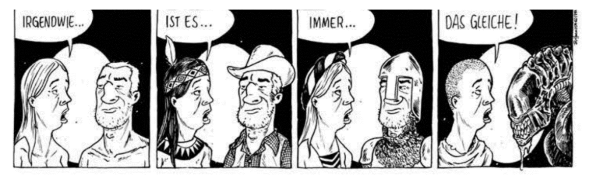
Figure 1. Comic strip by Hochstädter (2010, p. 70, cited in Packard et al., 2019, p. 155).

Packard et al. (2019) further highlight in their monograph on comic analysis that the gender category must always be considered in dialogue with other structural categories of comic production, reception and aesthetics (Packard et al., 2019). They illustrate this pointedly with a comic strip by Hochstädter (Figure 1) (p. 155 ff.):