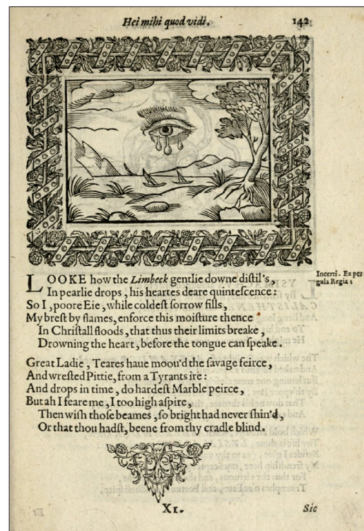
Fig. 3. Henry Peacham, Minerva Britannia , Emb. 142.

Later in the play Cordelia's function as a redemptive force is stressed when she helps to save Lear and reestablishes a right relationship with him ( KL , 4, 7). She kneels to receive Lear's blessing and weeps again in a very visual tableau recalling Ripa's emblem on the third Beatitude, « Beati, qui lugent, quoniam ipsi consolabuntur » which depicts a young woman kneeling and weeping. Cordelia's tears are part of a significant thread of Christian imagery in the play, and the echo of Ripa's emblem, along with the importance of the Biblical inter-