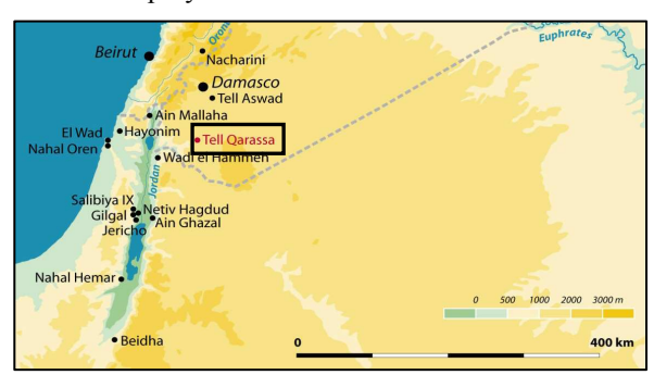
FIGURE 1. Location map of Tell Qarassa North

During the Early PPNB significant changes in the building techniques were developed, among others the transformation from round to square shape houses or the stabilization of large-scale villages (e.g. Goring and Belfer, 2008, and references therein). In our study we will analyze an in situ burnt roof found in an Early PPNB context from the site of Tell Qarassa North and we will briefly characterize some of the building elements employed in its construction.